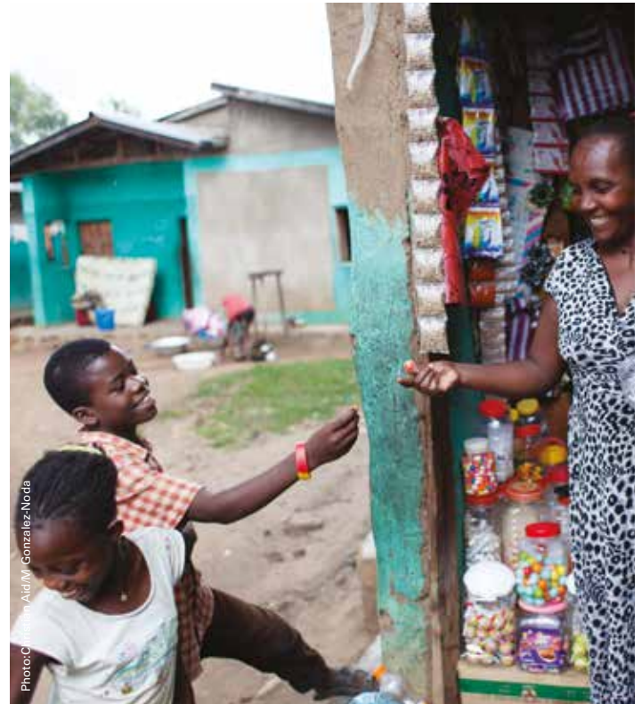
Young women and mothers will benefit from increased access to health information and services.

Pregnant women will benefit from improved maternal health services. Young women and teenagers will be specifically targeted, benefiting from increased access, empowerment, changed attitudes and improved reproductive health. Children under five will benefit from mothers' increased knowledge and access to facilities.